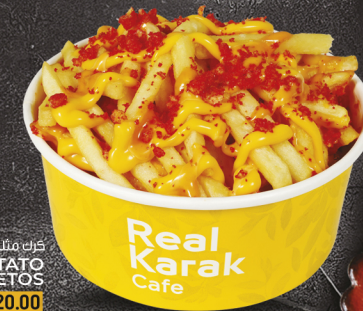
كرك مشح POTATO CHEESE CHEETOS 20.00