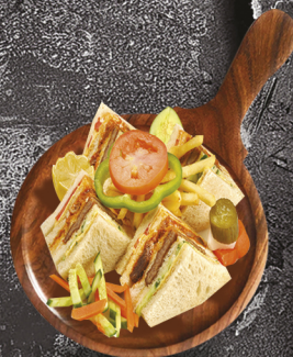
كرك مئلاج BEEF CLUB DHS 14.00