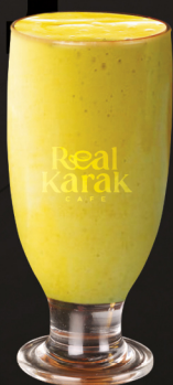
فازي FAZI DHS. 12/15