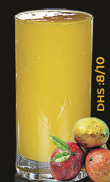
DHS : 8/10