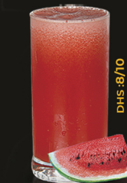
DHS : 8/10