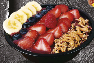
كرك مثليج ACAI BOWL DHS 30.00