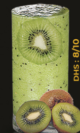
DHS : 8/10