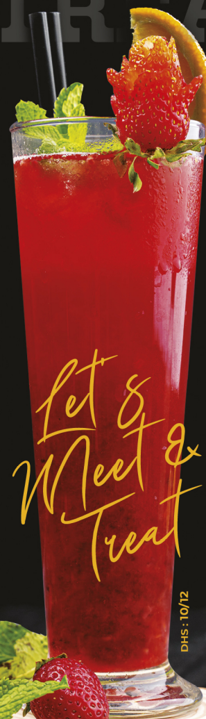
DHS : 10/12