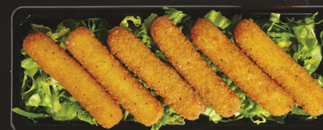
كرك مشح MOZERLLA STICKS 15.00