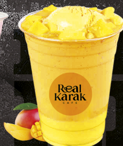
كرك مثليج MANGO COOL DHS 15.00