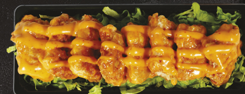
كرك مشح DYNAMATE CHICKEN 21.00