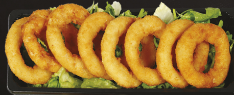
كرك مشح ONION RINGS 12.00