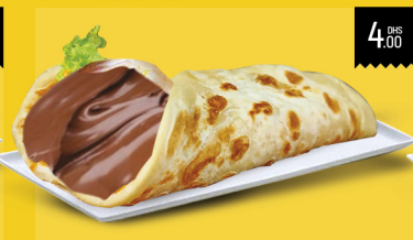
براتا الجبن NUTELLA PARATHA