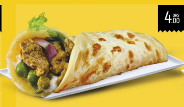
براتا الجبن KEEMA PARATHA