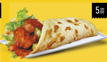
براتا الجبن CHICKEN CHILLY PARATHA