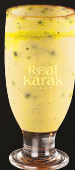
فلك FALAK DHS. 12/15

Juice is a drink made from the extraction or pressing of the natural liquid contained in fruit and vegetables. It can also refer to liquids that are flavored with concentrate or other biological food sources, such as meat or seafood, such as clam juice. Juice is commonly consumed as a beverage or used as an ingredient or flavoring in foods or other beverages, such as smoothies.