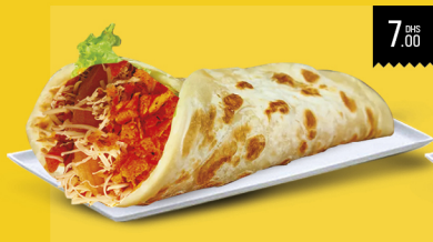
براتا الجبن FRANSISCO PARATHA