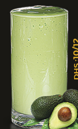
DHS : 10/12