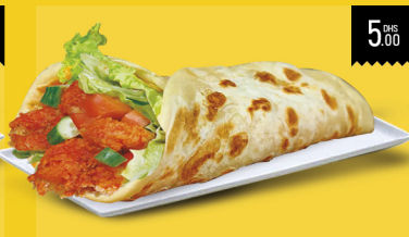
براتا الجبن BEEF NASHIF PARATHA