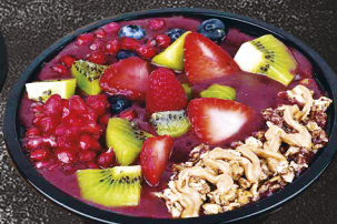
كرك مثليج ACAI BOWL MIX FRUIT DHS 35.00