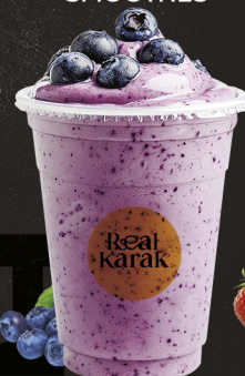
كرك مثليج BLUEBERRY DHS 15.00