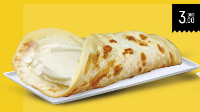
براتا الجبن CHEESE PARATHA