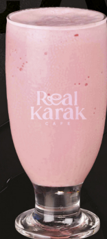
عوار قلب AWAR QALB DHS. 12/15