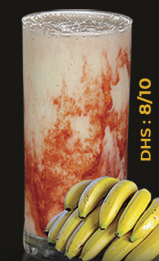
DHS : 8/10