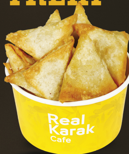
لقيمات فستق VEGETABLE SAMOOSA (8/10 PCS) DHS 10/12