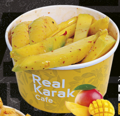
كرك مثليج MANGO MANIA DHS 15.00