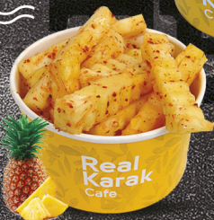
كرك مثليج PINEAPPLE MANIA DHS 15.00