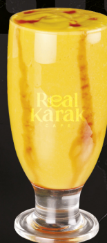
عربود ABOOD DHS. 12/15