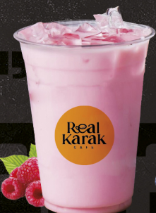
كرك مثليج RASPBERRY DHS 15.00