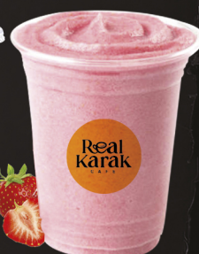
كرك مثليج STRAWBERRY DHS 15.00