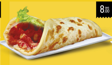
براتا الجبن CHEETOS CHICKEN PARATHA