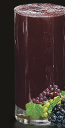
DHS : 10/12