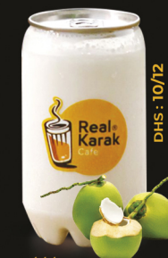
DHS : 10/12