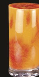
DHS : 12/15