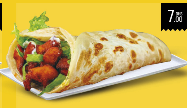
براتا الجبن TIKKA PARATHA