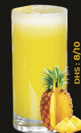
DHS : 8/10