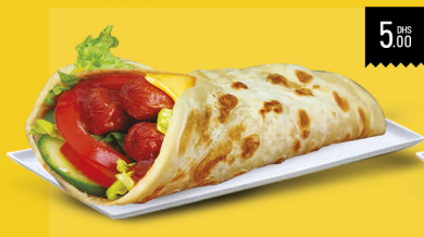
براتا الجبن HOTDOG PARATHA