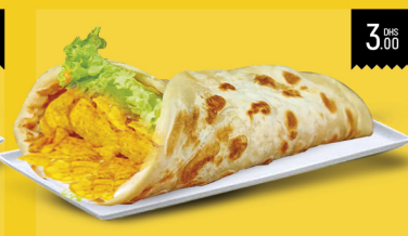
براتا الجبن CHIPS OMAN PARATHA