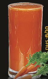
DHS : 8/10