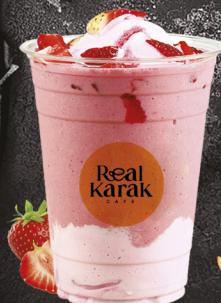
كرك مثليج STRAWBERRY COOL DHS 15.00