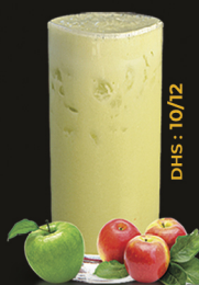
DHS : 10/12