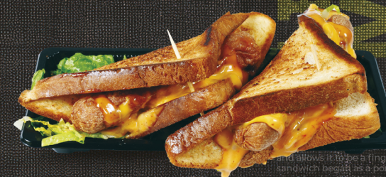
SEMI HOT DOG