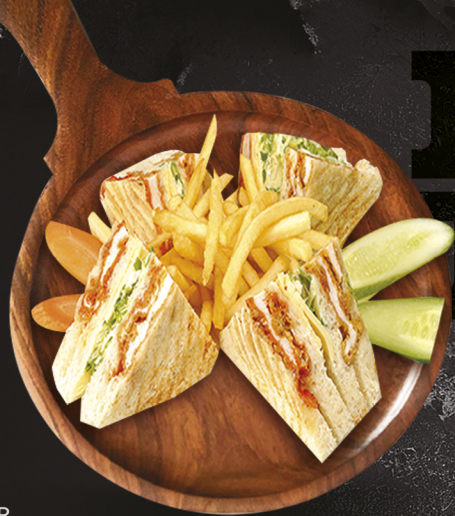
كرك مئلاج ZINGER CLUB DHS 15.00