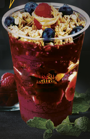
كرك مثليج ACAI CUP DHS 25.00