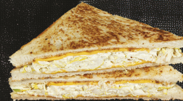
CHICKEN SLICE SANDWICH