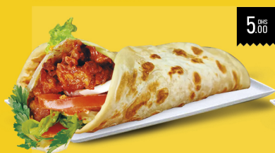
براتا الجبن CHICKEN NASHIF PARATHA