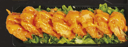
كرك مشح DYNAMATE SHRIMPS 23.00