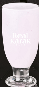
عربود CERELAC DHS. 12/15