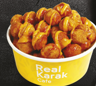
كرك مشح CHICKEN POPCORN 22.00