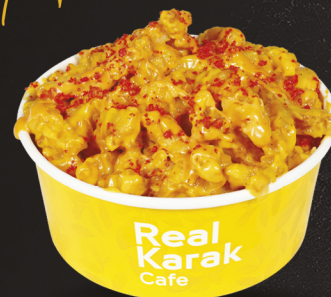
كرك مشح VOLCANO FRIES 25.00