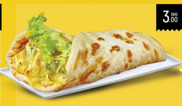
براتا الجبن OMLETE PARATHA