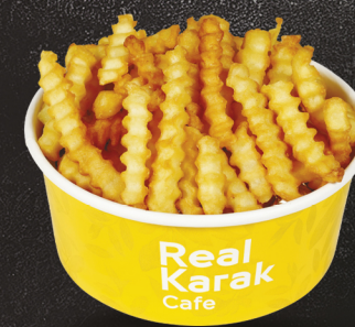
كرك مشح CRINKLE FRIES 12.00