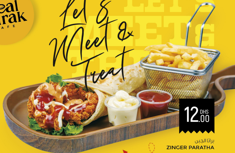
براتا الجبن ZINGER PARATHA